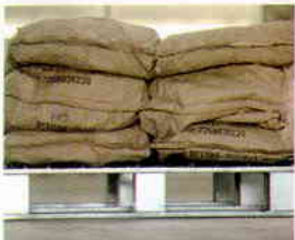
GUNNY BAG STORAGE