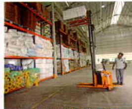
HANDLING WITH FORK LIFT