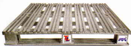
GRIP GI DISPO