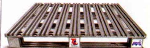
GRIP GI DURA