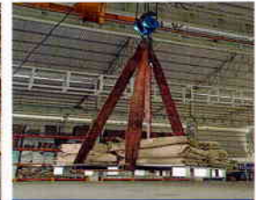
HANDLING WITH CRANE