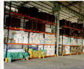
STACKING IN WAREHOUSE